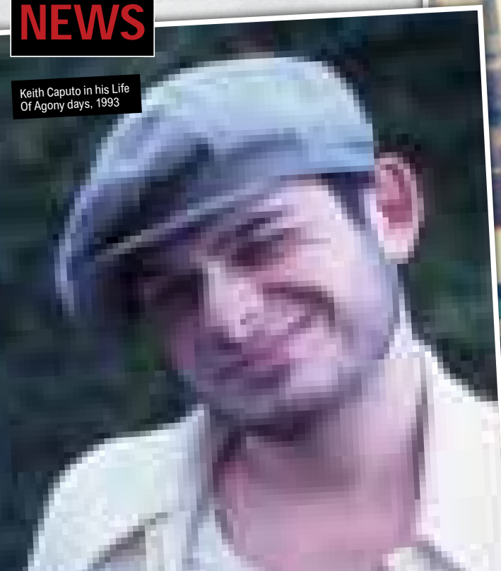
Keith Caputo in his Life Of Agony days, 1993